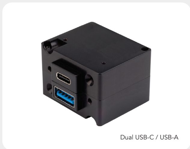
Dual USB-C / USB-A

High power TA202 Series Chargers simultaneously provides 15 watts / 3 amps of power per charging port to electronic devices.